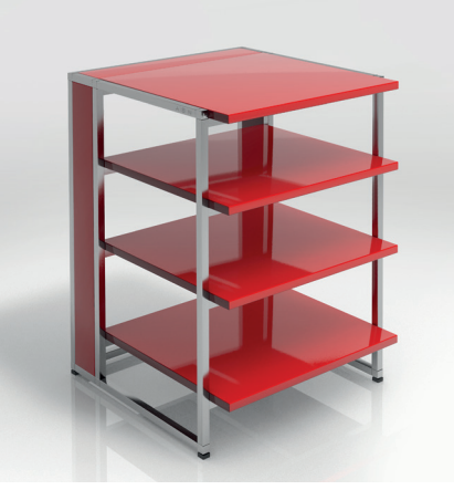
LA_TERRAZZA_1.4 Frame brushed stainless steel look

Colors of the shelves/boards (Anti-fingerprint Matt)